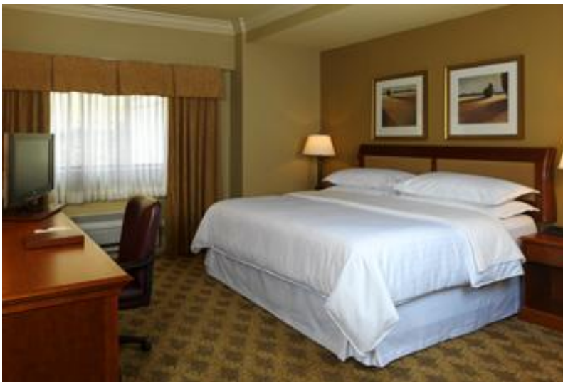
A GUEST ROOM